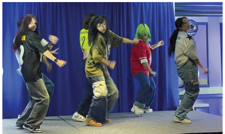
The 25th anniversary celebration of PSU's College of Information Sciences and Technology featured wonderful performances from PSU's a cappella group Blue in the Face and dance group Bounce!